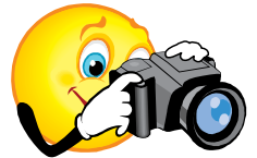
Photo ID will be available the following dates/locations